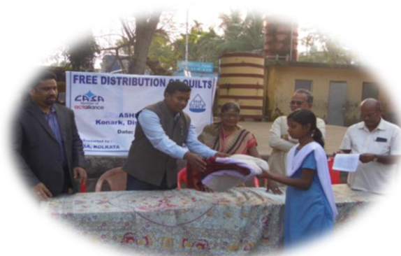
DWO, Puri Distributing quilt to a student