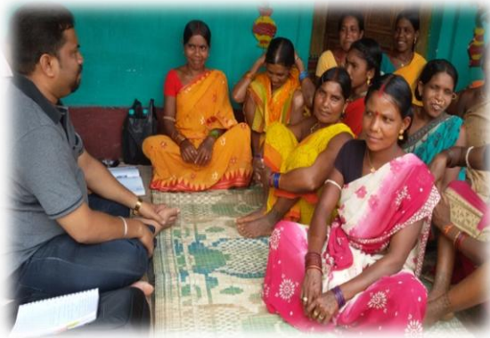
FGD with women farmers

Mahila Kissan Sashaktikaran Pariyojana (MKSP) is a flagship programme of Ministry of Rural development, Govt. of India for empowerment of women farmers through promotion of sustainable agriculture practices. Besides, it also aims to contribute for improved health and nutritional security, reduction of drudgery of women agriculture workforce and their socio-economic empowerment.