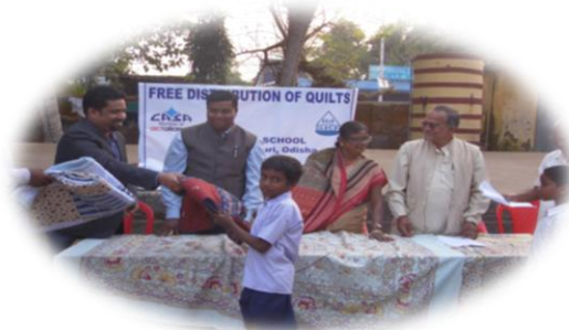
Chief Executive, SKF distributing quilt to a student