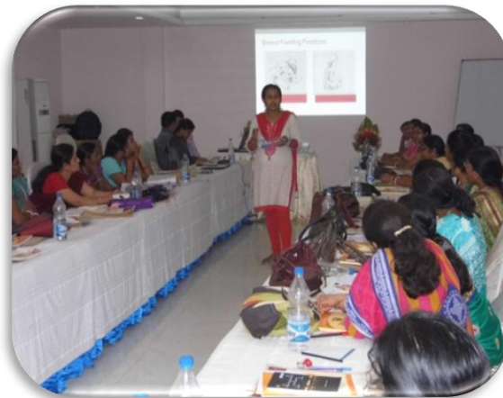
Trainer providing training on IYCF

The training was conducted in nine batches and the thematic areas covered under the training programme were: Basics of IYCF, Basic concept of nutrition, Severe Acute Malnutrition and referral of SAM children, Modalities of implementation of National Iron plus Initiative, Importance of Iodine, deficiency orders and its effects on growth and development of children.