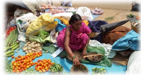
A woman farmer selling her production at local Haat

SKF has undertaken the first mid-term evaluation of such a project implemented by the field partner in Pottangi and Semiliguda Blocks of Koraput District to assess the progress of the project against stated outputs as envisaged, as well as identify issues and recommend course of corrections. The evaluation also highlighted issues and challenges affecting effective and efficient implementation of outputs and their contribution to project outcomes and impact and recommended suggestion for smooth implementation and extension of the project.