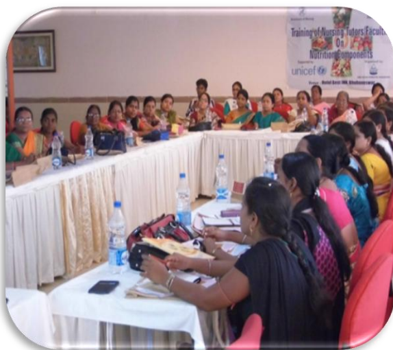
Nursing Faculties at the Training Programme

With an aim to support nursing tutors/faculties on different National Nutrition programmes as per the revised nutrition curriculum, SKF organized training programme of the nursing tutors/faculties in collaboration with UNICEF and Directorate of Nursing, (Dept. of H&FW, Govt. of Odisha) during May 2015-July 2015. 370 faculties from 27 Government and 121 Private colleges across all the 30 districts of Odisha participated in the training programme.