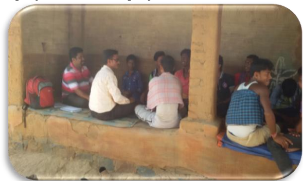
FGD with unemployed youths

The study was commissioned by PU Odisha, one of the partners of Plan India in two Blocks namely Kaptipada of Mayurbhanj and Ghatagaon of Keonjhar District to understand the status of different sectors providing employment opportunity and scaling up of those sectors for potentially linking the youth mass for both skill and market based employment with specific interest on both job oriented and enterprising engagements. The study tried to identify the most potential linking sectors for appropriate skill development, market linkage and service linkage of the youth mass to enhance earning opportunities at family level with sustenance of their livelihood. The study found that Agriculture, NTFP, Livestock, Skill based Self Employment and market based employment are the five major sectors providing employment to the people which may be promoted in the region. These sub sectors have the largest potentiality for both self employment and employment.