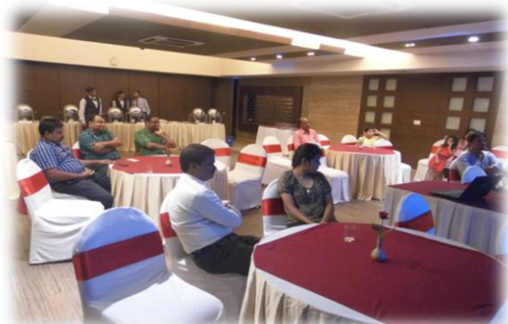
The participants at the Annual Meeting