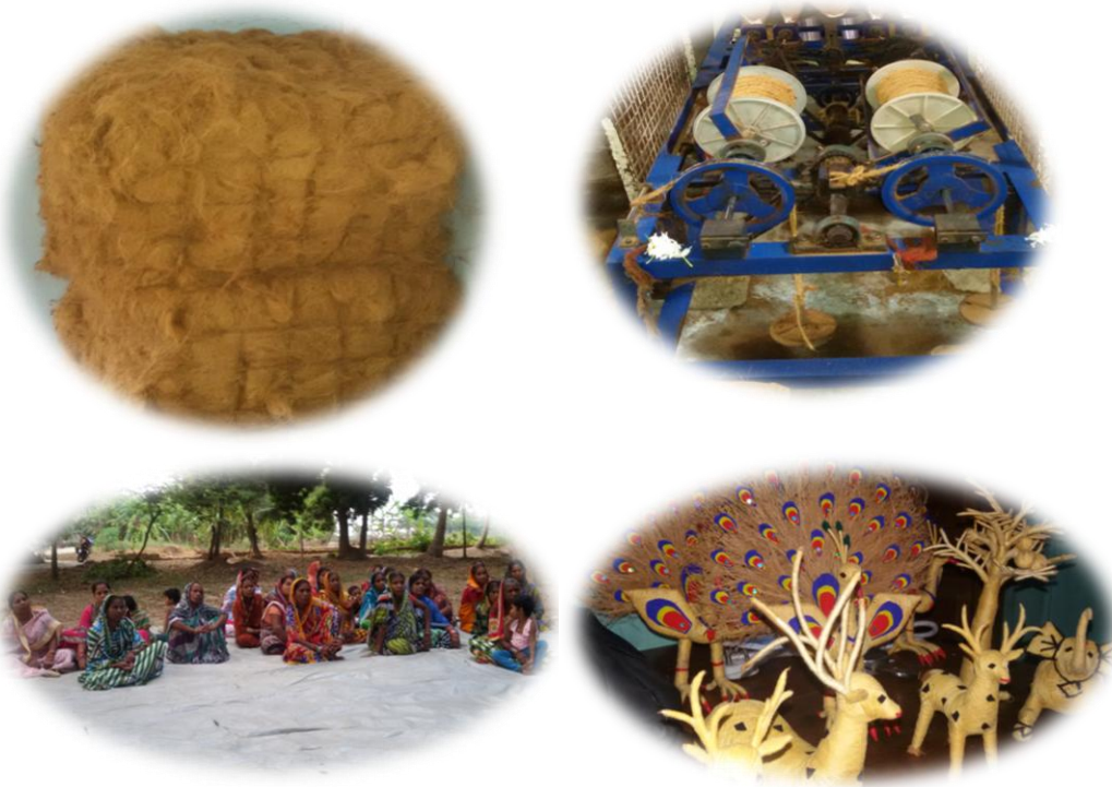
Coir Sector Activities by SKF

Samaj Kalyan Foundation is working on cluster development activities for coir sector, handicrafts, etc. since last 8 years. It is implementing an income augmentation programme for Adolescent girls and women engaged in coir sector in Sakhigopal. They are formed into Self Help Groups and engaged in coir yarn, mat & mattings and handicraft items. Similarly, SKF has imparted coir handicraft making training to adolescent girls and women in 10 villages of Nimapada and Gop Blocks and they are now selling their items in Konark and Puri and also participating in different District level trade fairs, Rathayatra festival, Konark Dance Festival etc.