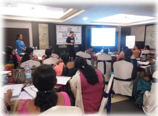
Resource Person from UNICEF imparting Training

With an aim to support nursing tutors/faculties on different National Nutrition programmes as per the revised nutrition curriculum, SKF organized training & Refresher of the nursing tutors/faculties in collaboration with UNICEF and Directorate of Nursing, (Dept. of H&FW, Govt. of Odisha). In total four batches of training and twelve batches of refresher conducted during the month of August & September 2016 on different National Nutrition Programmes as per revised curriculum for the nursing tutors/faculties. The training batches were of three days duration while the refreshers were conducted for one day each with the similar subject matters as in the training. The subjects covered under the programme included Basics of Nutrition, Basics of IYCF, WHO Growth Monitoring, Management of Severe Acute Malnutrition (SAM) and Concepts of Nutrition Rehabilitation Centre (NRC), Modalities of implementation of National iron Plus initiative (NIPI), Importance of Iodine Deficiency Disorder and its effects on growth & development of children Importance of VAS and De-worming for children and maternal calcium supplementation & de-worming. Finally, in order to assess the impact of the training, a pre and post test was conducted among the trainees to map their understanding and the same is placed in the report in specific subjects/chapters in a consolidated form.