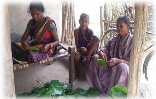
Survey under Progress in forest fringe villages