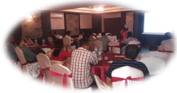
The Director, SKF making presentation on Activities of SKF