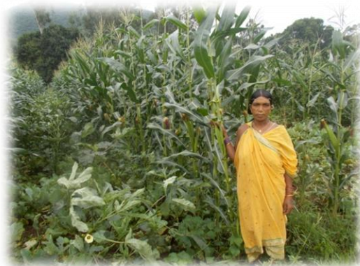
Evaluation under progress