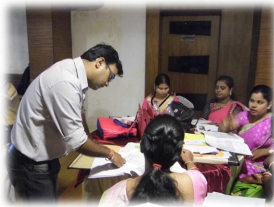
Resource person clearing doubt during the training session